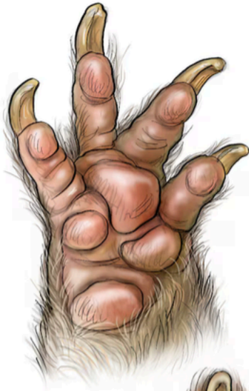
Healthy front and back paw